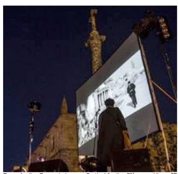
Trans-Aeolian Transmission - Festival Jardins Efémeros, Viseu, PT